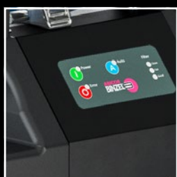
Control element FEC

The FEC works with the highly efficient cyclone technology and separates particles upstream from the filter. Therefore, requires less cleaning.